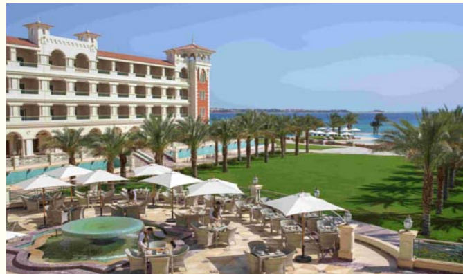
Botanicals are the boundary between luxury and pleasure