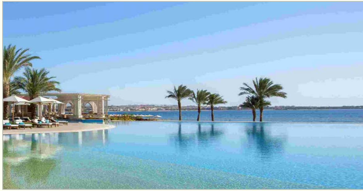
Infinity pools seem to cascade into the red sea