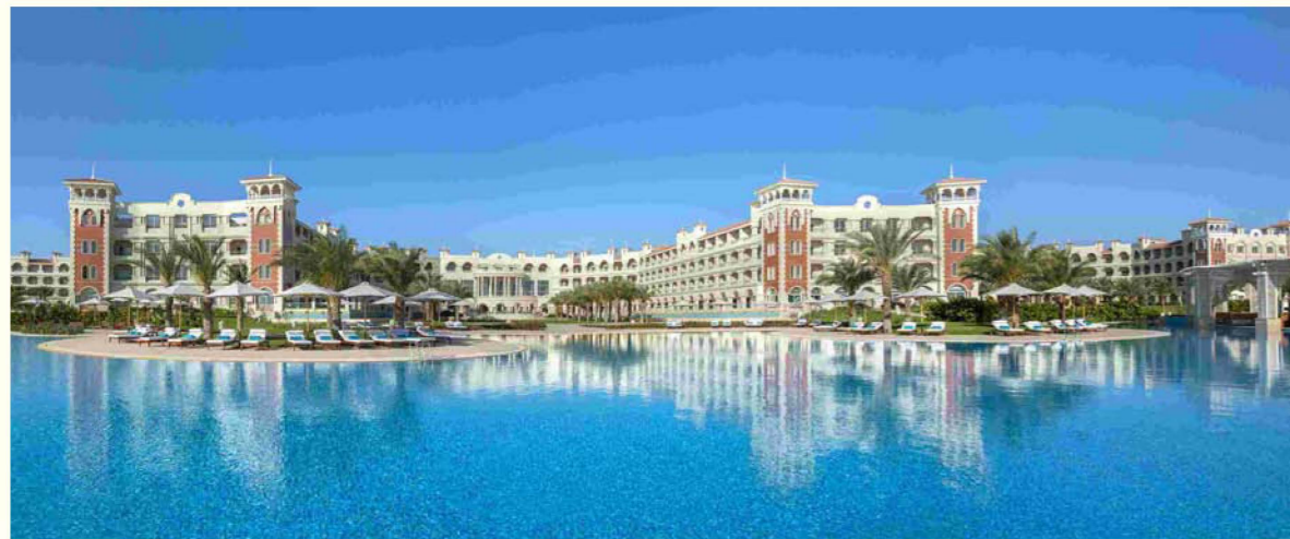
Palace of luxury and welfare