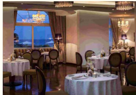
All day restaurant serving the finest delicacies

The total number of rooms & Suites is 615 (427 with sea view, 33 with a private swimming pool and sea views, and 155 with garden view). All rooms are equipped with 32-inch LCDTV and another is the bathrooms of the royal suites, all with satellite channels (more than 50 international channels) and wireless internet access (including all public areas). Exclusive amenities will be used to all rooms, while 24-hour butler service will be provided at royal suites.