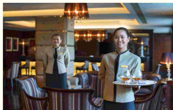
Traditional Arabic Palace design