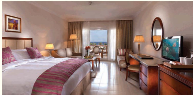
Double bedroom with glamorous views of the Red Sea