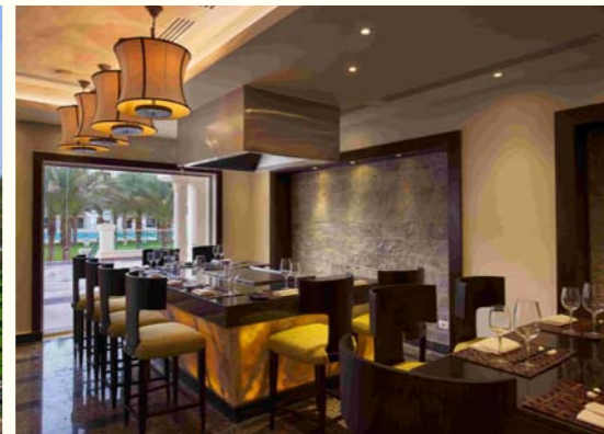
A glance of royal vacation

Baron Palace Sahl Hasheesh "opening Summer 2013"