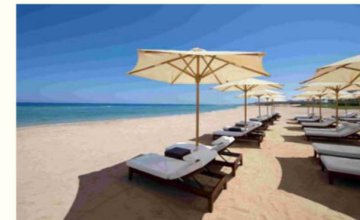
The luxurious Palace offers the ultimate in tranquility